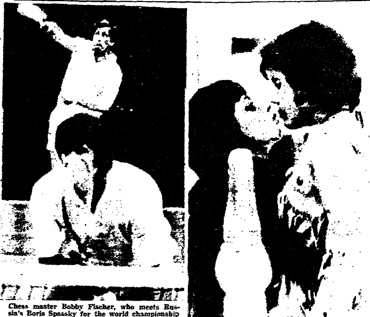
Chess master Bobby Fischer, who meets Russia's Boris Spassky for the world championship next month, hibs a serve while competing in the annual Dewar's sports celebrity tennis tournament at Rancho La Costa, California, on Tuesday. His partner is Gail Goodrich of the Los Angeles Lakers pro basketball team.

"It is the duty of every government to prevent the use of its territory for criminal activities, and in particular crimes of violence directed against human life in other states. The government of Lebanon is no exception. If it does not take effective measures to eliminate terrorist activities on and from its soil it must be considered as consciously violating the obligations incumbent on it."